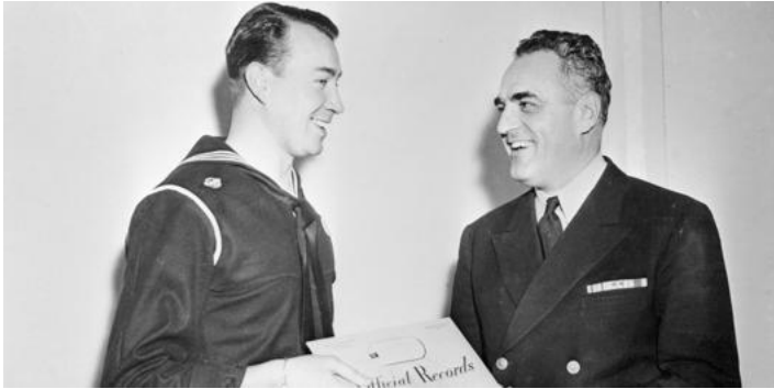
William Patrick Hitler, 34, left, as he receives his discharge from the US Navy

Adolf Hitler's half nephew enlisted in the US Navy with the intention of combating the Nazi regime. But it took a few attempts, which included a letter to President Franklin D. Roosevelt, for William Patrick Hitler to get special permission to join the fight.