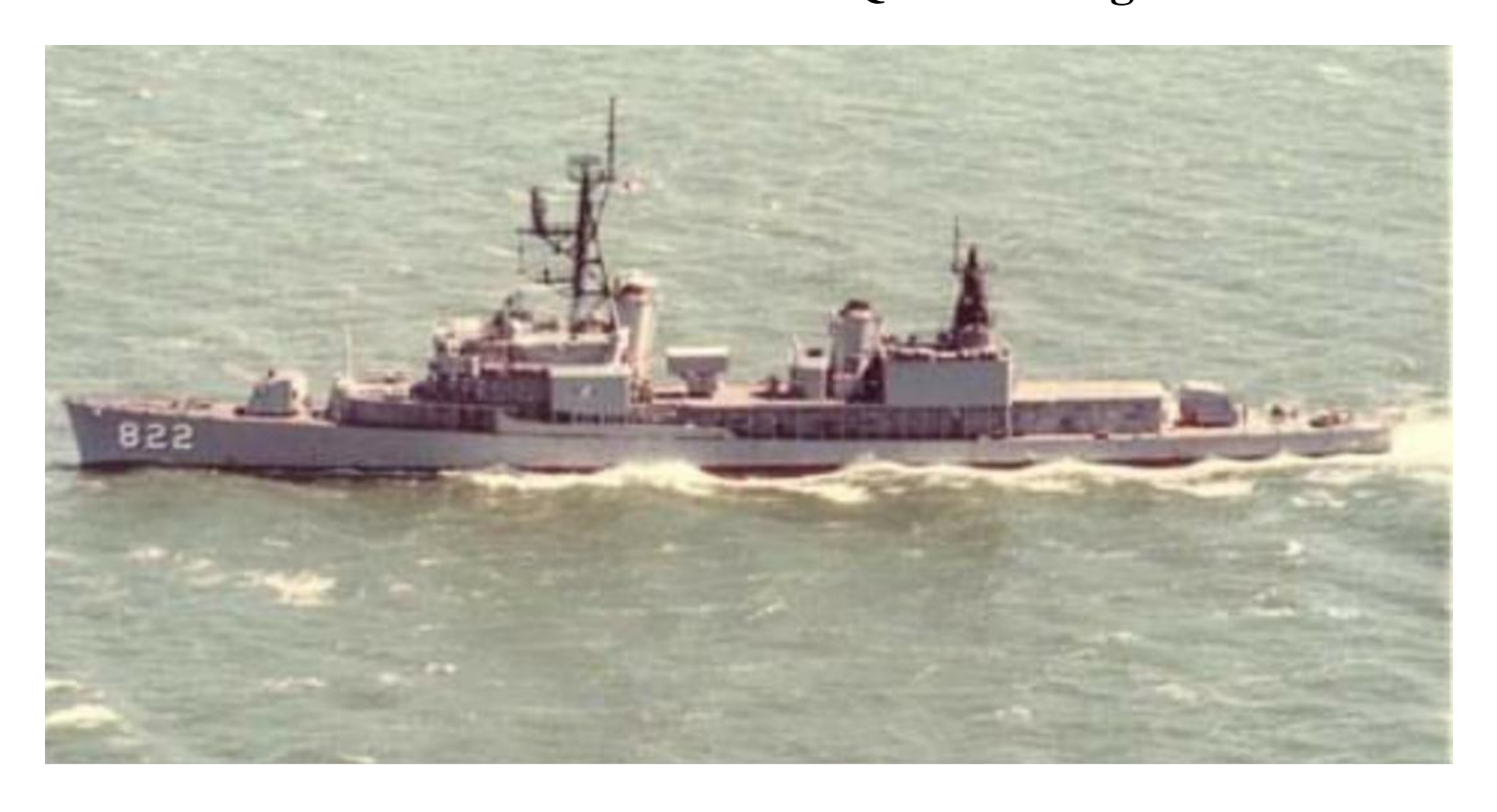
USS R.H. McCard DD822- January 2022 Feature Photo, J.F. Kennedy FB Group