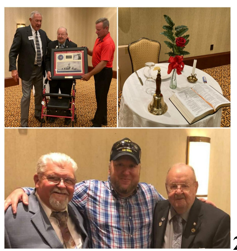
2021 Reunion Banquet