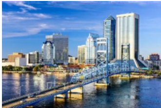
City of Jacksonville, Fl.