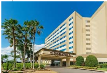
DoubleTree by Hilton Hotel