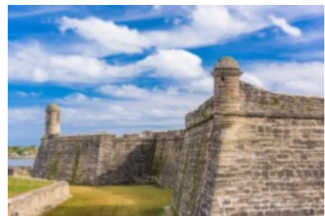
Fort Matanzas National Monument