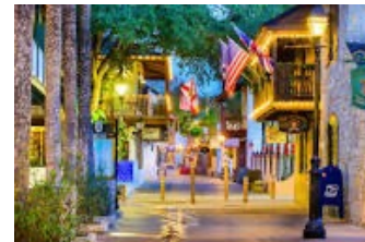
City of St. Augustine, Fl.