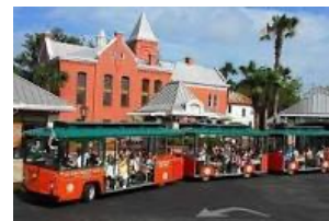
Trolley Tour, St Augustine